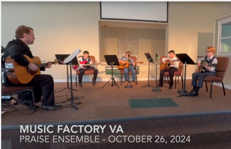
MUSIC FACTORY VA PRAISE ENSEMBLE - OCTOBER 26, 2024

Click the image above to watch our most recent Praise & Worship Ensemble video on our YouTube channel or click this link below.