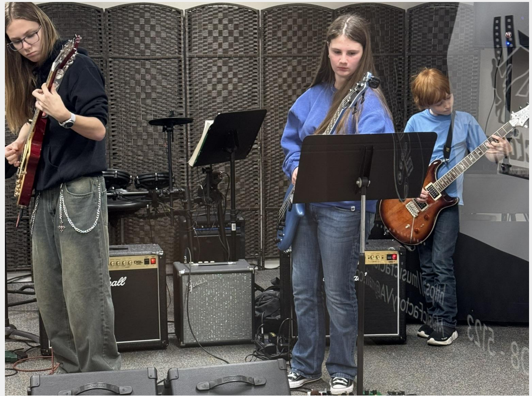
Rock Ensemble rehearsals restarted last month because Tuesday nights ROCK at the Music Factory VA.